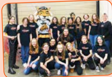
The middle school A Cappella group sang at the Gambler's game

A Vision of Pride and Excellence HOME OF THE PHANTOMS