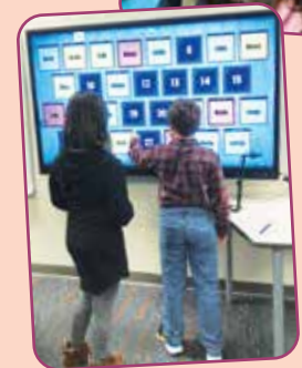
Word Work at the Intermediate School