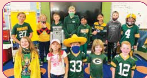
Packer Day at Hemlock Creek Elementary School