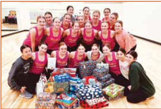
The West De Pere Dance Team & Families adopted a family through the Desert Veterans of Wisconsin for the holiday season.