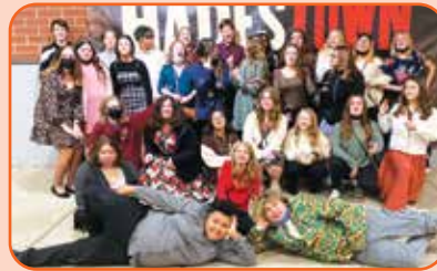
8TH GRADE CHOIR TAKES IN A SHOW AT THE PAC!