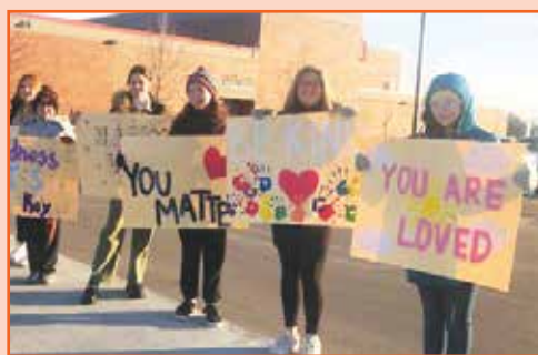
The Middle School HOPE Squad & Art Club teamed up to make signs of Hope & Support. Teachers and students held signs up in front of the school. Keep spreading kindness!